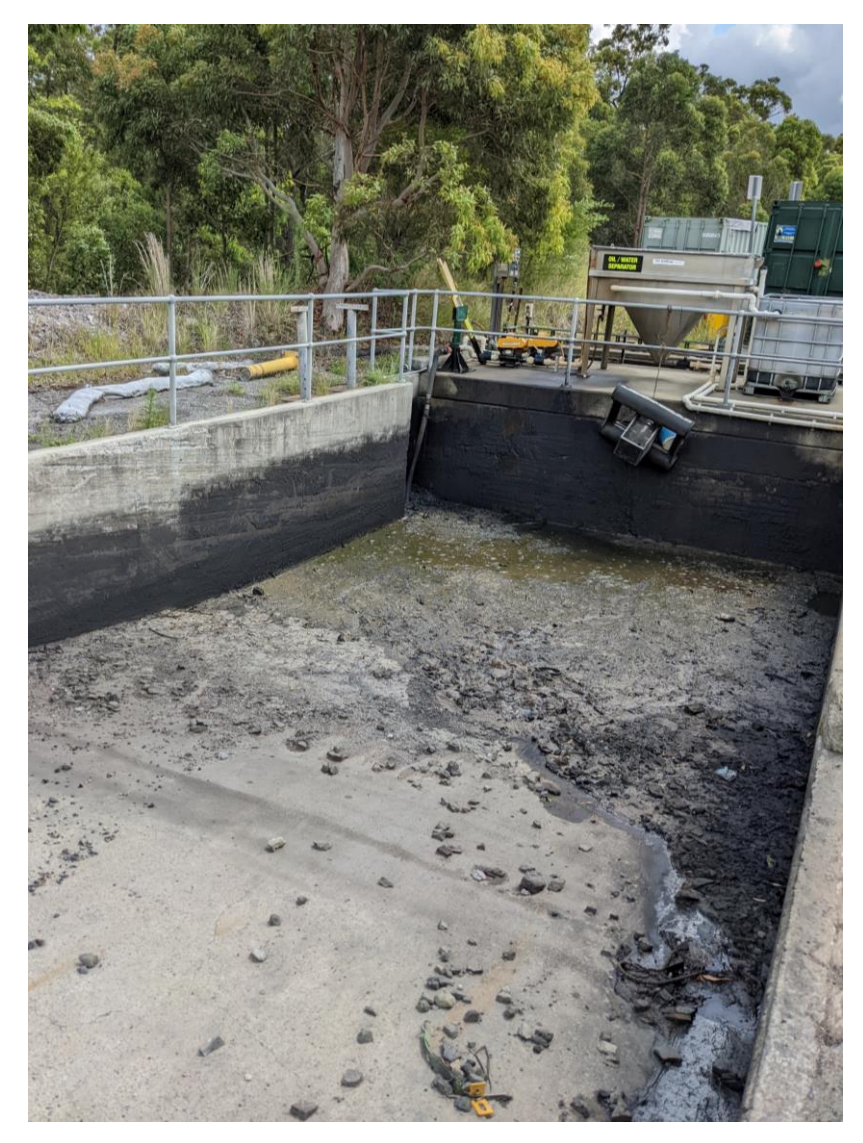
Plate 3 Su