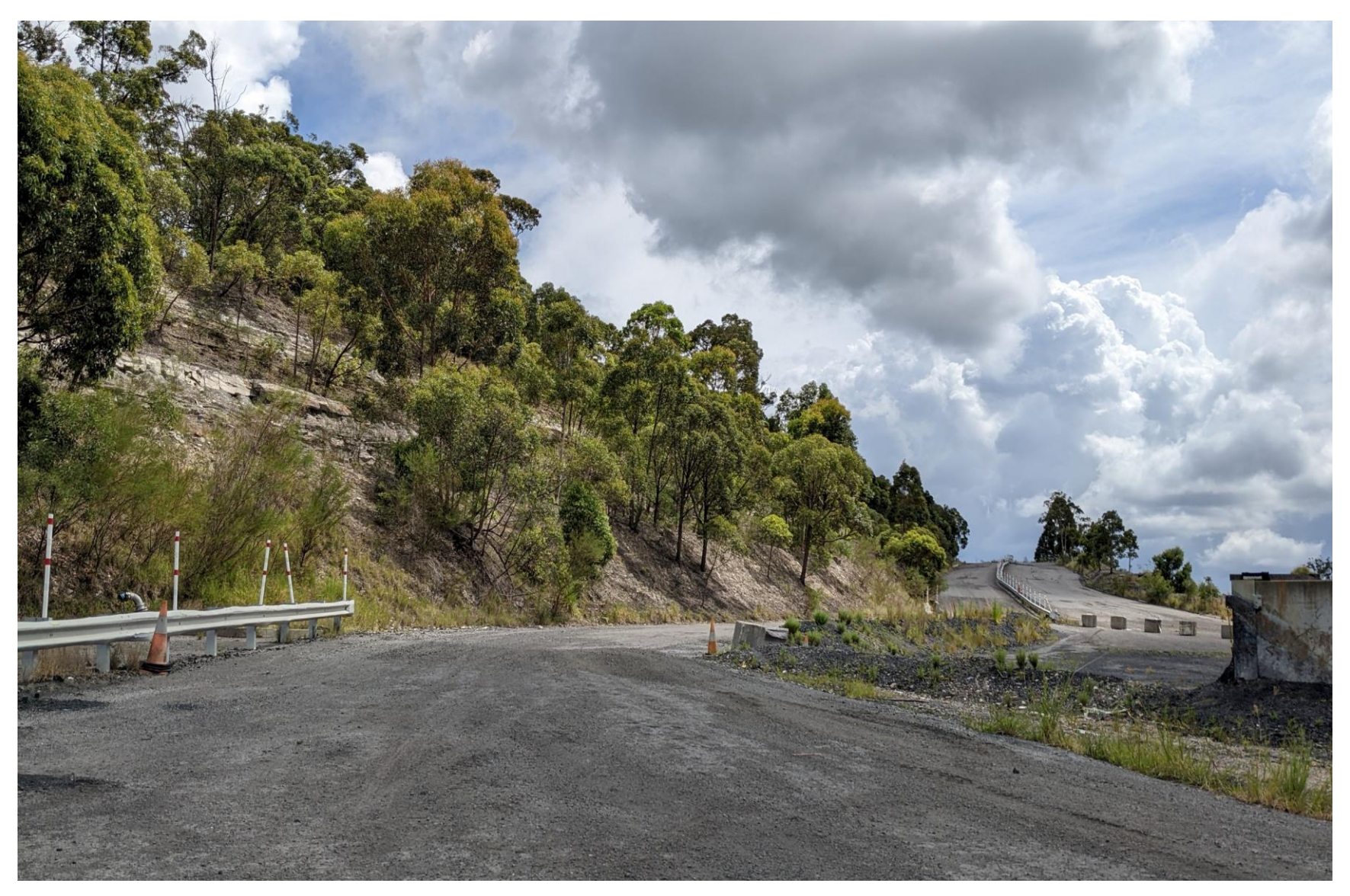
Plate 12 Haul road from Abel Coal Mine entrance, with incident rehabilitation of vegetation on escarpment