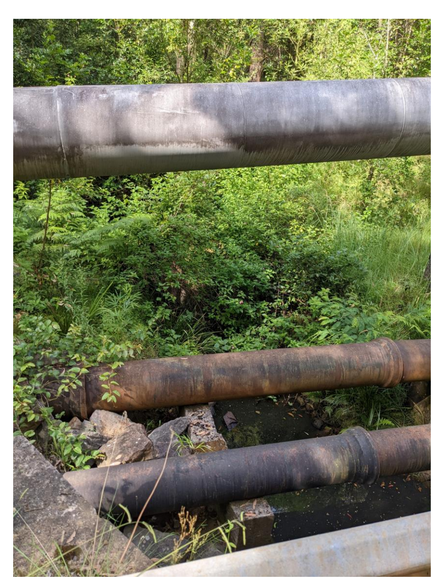
Plate 6 Four Mile Creek at Discharge Location

Plate 5 Four Mile Creek at Discharge Location