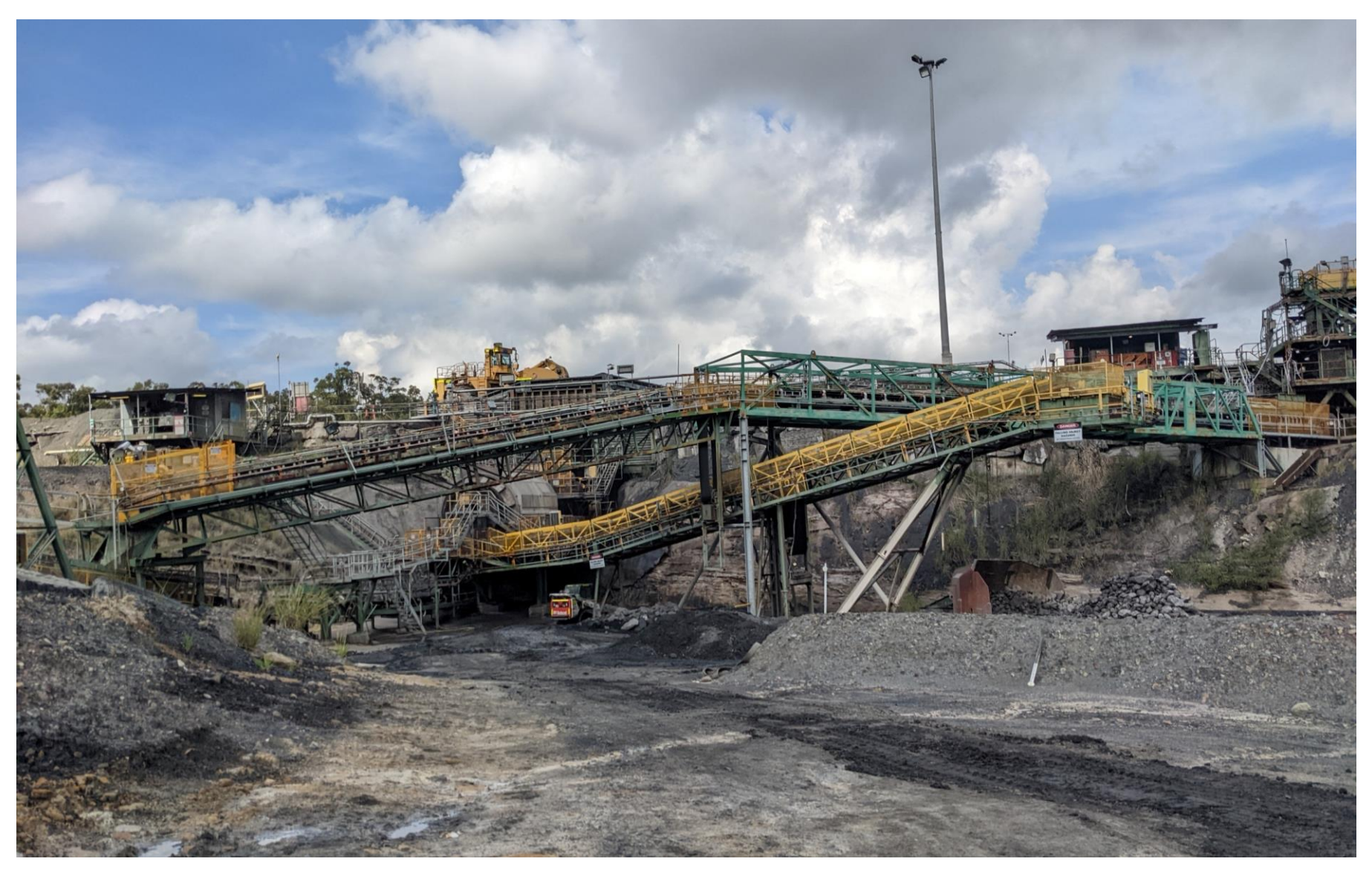
Plate 7 Bloomfield CHPP/Washery