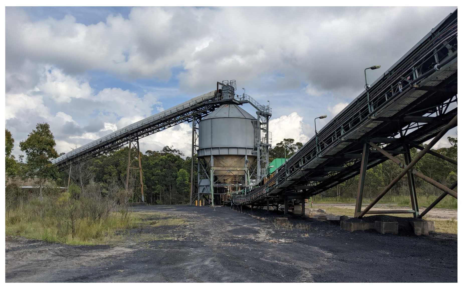
Plate 10 Conveyors at Bloomfield CHPP to the rail load out, rail loop and rail spur