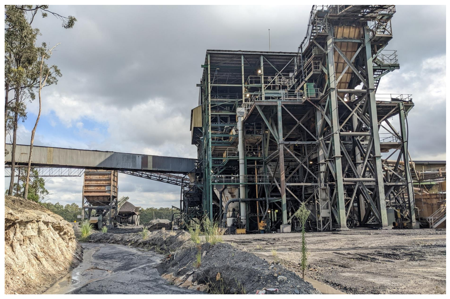
Plate 8 Bloomfield CHPP/Washery