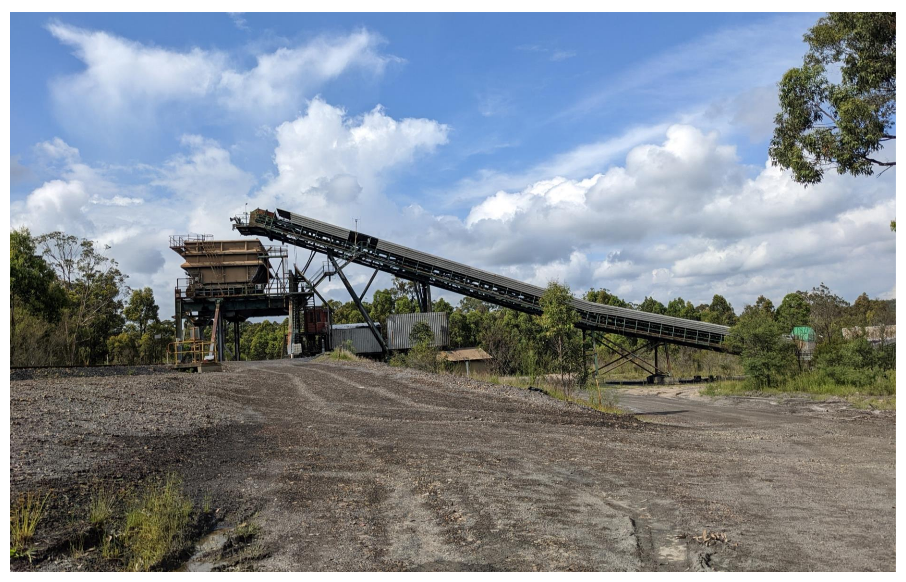
Plate 9 Bloomfield rail load out facility, rail loop and rail spur