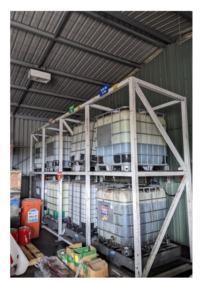
Plate 2 Fuel and oil containment