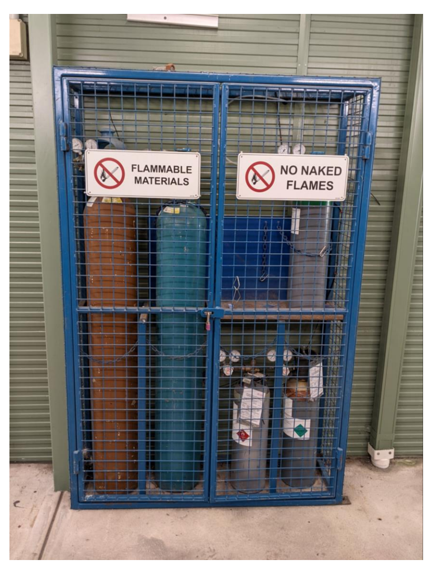
Plate 4 Labelling of hazardous materials