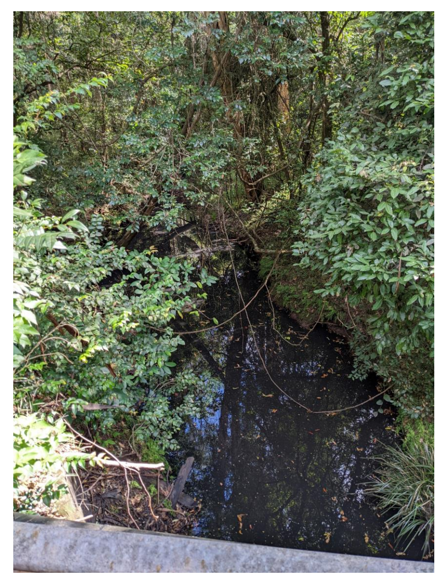
Plate 5 Four Mile Creek at Discharge Location