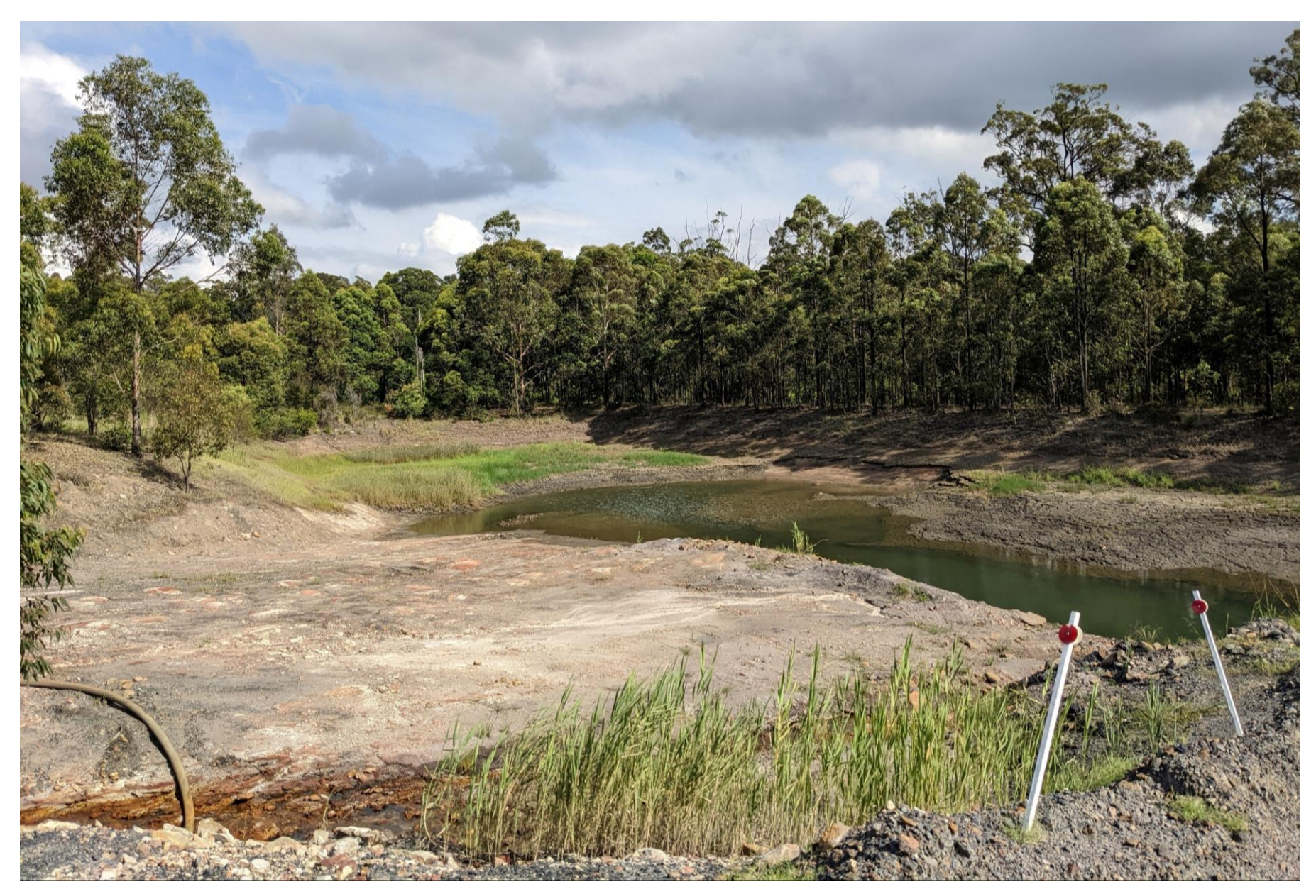
Plate 11 Sediment pond at Bloomfield CHPP, in the process of being dredged to improve capacity