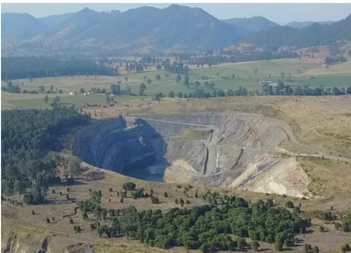
Bowens Road North Open Cut Pit Before

At the Coal Handling Preparation Plant (CHPP), demolition works are commencing, with some infrastructure set to be transferred to other Yancoal sites for re-use. Meanwhile, planning is in progress for the disconnection and decommissioning of the rail loop.