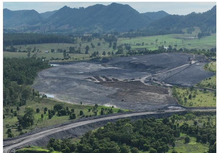
Bowens Road North Open Cut Pit 2025 Landform Creation